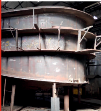
Lower Shell- Bhushan Steel