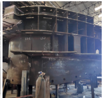
Lower Shell- JSW Toranagallu