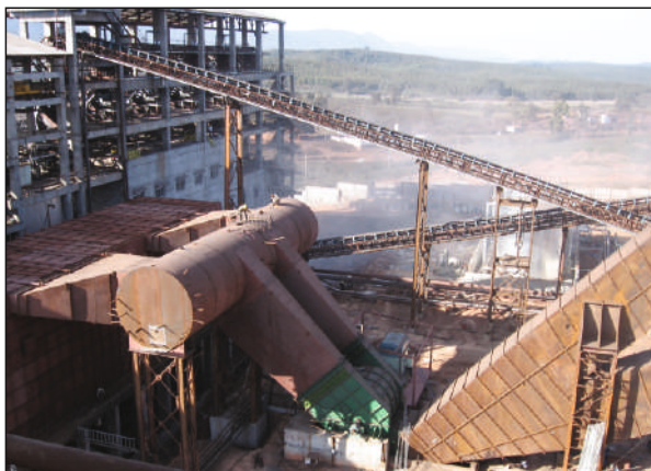
Rotary kiln, cooler & ABC / DSC equipment for sponge iron plant