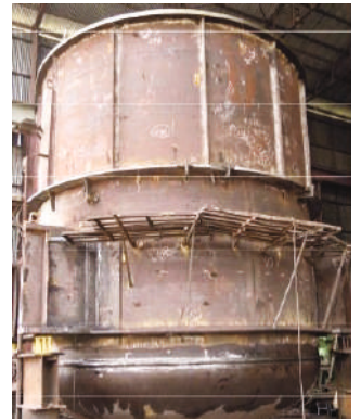
VD Vessel & Cover Assembly for SMS Siemag