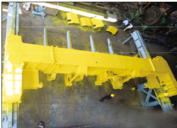
Charging Machine for RSP Project through Tenova