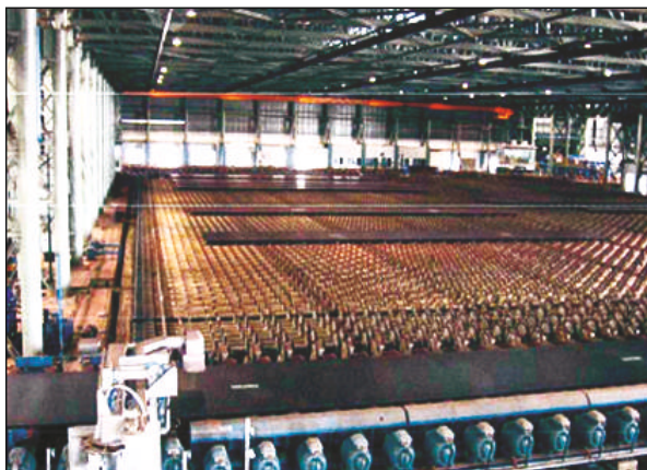
Cooling Bed 60 Mtr x 80 Mtrs with roller tables for Welsupn Anjar for Plate Mill Project