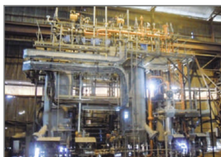
Ethylene dryer for Opal- Dahej

LSIL major clients included ONGC, NPCIL, BOC GAIL NRL Numaligarh, MRPL Mangalore, Mangalore Fertilizers, Technip, Madras Fertilizers, Chennai, IOCL, SPIC, BPCL, Fertilizers Corporation of India, IFFCO, ISRO, SHAR, JK Synthetics, RCF Mumbai , Zuari Agro , IPCL etc. For Nuclear Power Corporation LSIL have supplied Heavy Water Vapour Recovery Dryers for their TAPP, Tarapur, KAIGA, KAPP & RAPP projects.