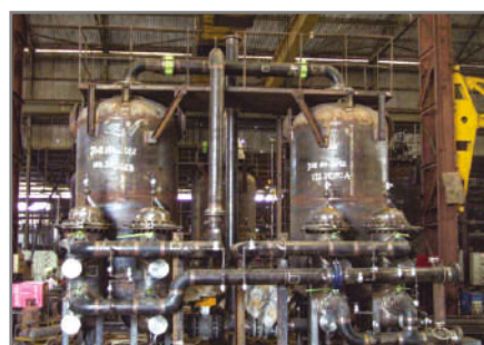
3 nos Air Dryer Unit 3 Type : Heatless, Capacity : 13400 NM 3 /hr For Paradeep Refinery project of IOCL

Skid mounted Drying package for Air, Liquid and Gases